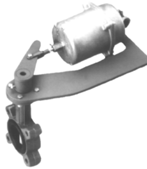
Two-Way VF Series Butterfly Valve with D-3153 Actuator